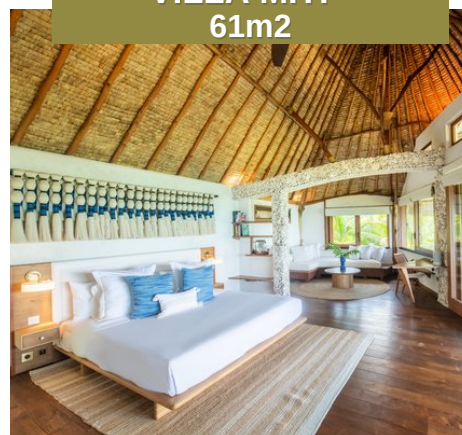
VILLA MITI 61m2