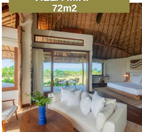
VILLA MIRI 72m2

The island has three beach villas for two people, designed by local designer Alain Fleurot. The villas are decorated with coral from the island, the frames are made of ironwood from the Motu, the terraces are made of Burmese teak, and the steps are made of mahogany and white stone.